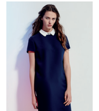
Dress : Raysse 170€