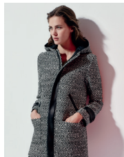
Coat : Munch 325€ Pants : Pinto 145€