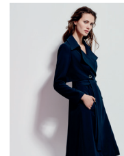
Coat : Miro 285€ Jeans : Lou 125€