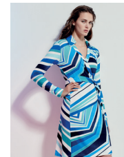
Dress : Ritter 135€