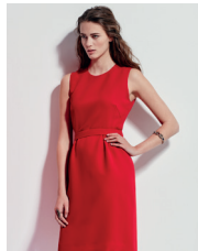
Dress : Romani 185€