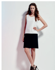
Dress : Ruben 135€