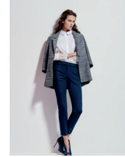
Jacket : Velazquez 225€ Shirt : Carla 135€ Pants : Pinto 145€