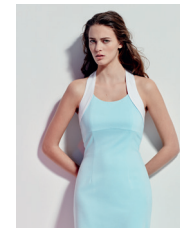
Dress : Rodin 175€