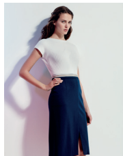
Sweater : Amel 95€ Skirt : Julianne 115€