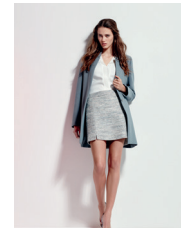
Coat : Mia 295€ Top : Tara 105€ Skirt : Johns 159€