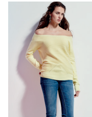
Sweater : Amelie 110€ Jeans : Louna 130€