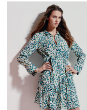
Dress : Rola 165€