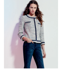
Jacket : Vermeer 255€ Jeans : Louna 130€