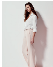
Shirt : Cabanel 135€ Pants : Pissaro 155€