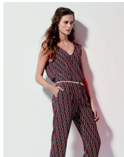
Jumpsuit : Ciani 220€