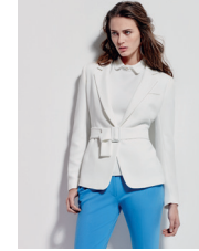
Jacket : Vinci 255€ Top : Toulouse 125€ Pants : Pinto 145€